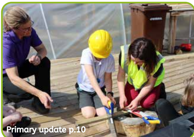
Primary update p.10

Meet the team and find out more about English at West Kirby School, p8