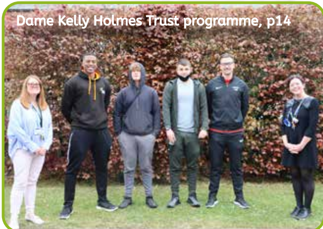
Dame Kelly Holmes Trust programme, p14