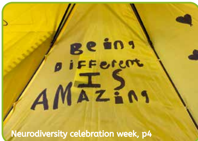
Neurodiversity celebration week, p4