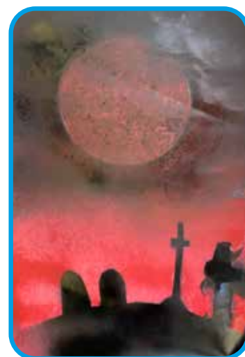
Blood Moon by Kieran Spray paint, 42cm x 29cm