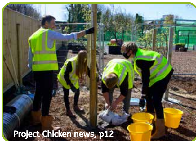
Project Chicken news, p12