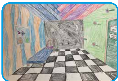
Surreal Room by Amy Watercolour and Pencil, 27cm x 37cm