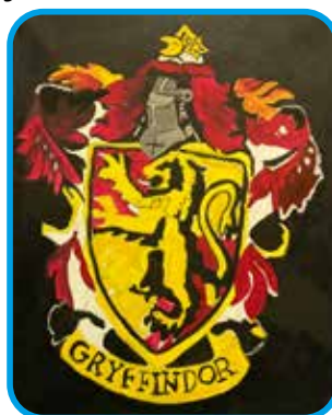
Gryffindor by Riley Acrylic paint, 58cm x 40cm