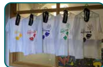
T-shirts designed by Post 16