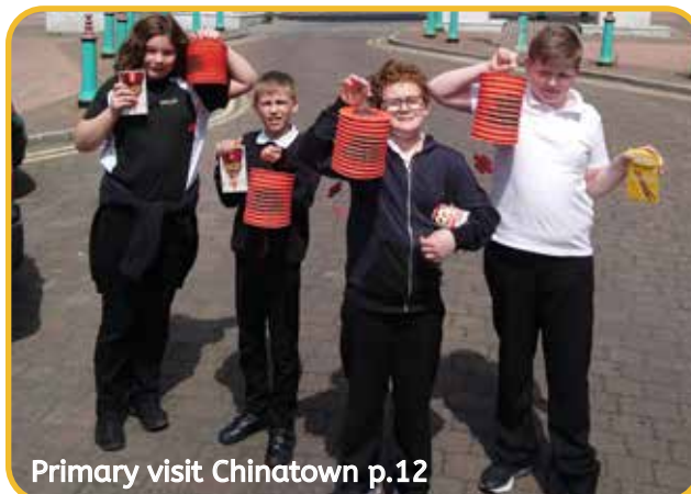
Primary visit Chinatown p.12