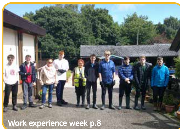
Work experience week p.8