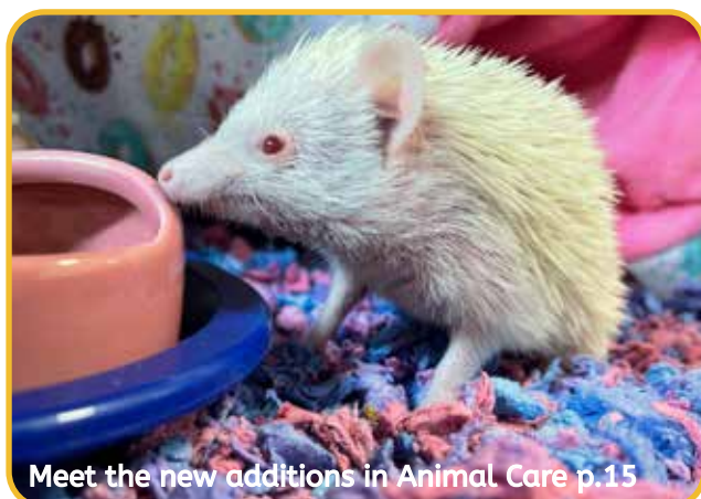
Meet the new additions in Animal Care p.15