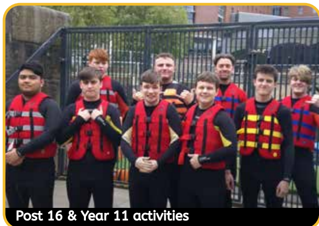
Post 16 & Year 11 activities