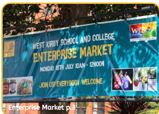
Enterprise Market p.3

Welcome to our celebration of summer term